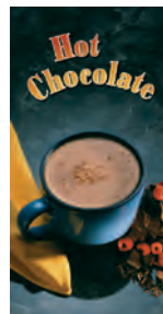
Model FMD-1 available with optional Hot Chocolate Display